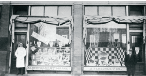
Image: Original Alberta Meat Market on Gaetz Avenue, ca. 1910s; P127