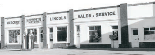
Image: Hepworth Motors, ca. 1970s