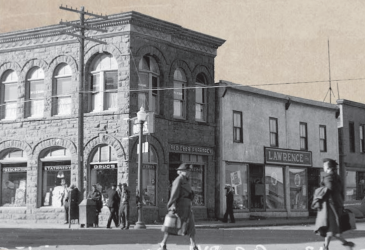
Greene Block, ca. 1940; P3229

As you visit the sites of these early businesses, you'll get a glimpse into Red Deer's early days and experience a bit of your own “Saturday in the City.”