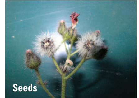
Alberta Sustainable Resource Development