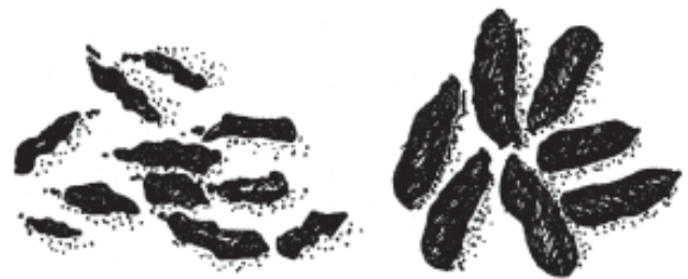
Figure 5. Actual size of mice droppings (left) versus rat droppings (right).

Rats produce up to 25,000 droppings per year, so they can usually be detected if they have been present for even a short time. Rat droppings are blunt at both ends and the shape and size of an olive pit, measuring 1.25 to 1.5 centimetres (.5 - .75 inches), and shiny black (Figure 5). Droppings fade in time and soon turn to grey-white.