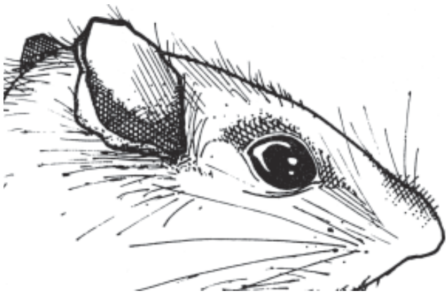
Figure 3. Detail of ears and eyes of the Norway rat

The length of tail is about 15 to 22.5 centimetres (6 - 9 inches) and is always shorter than the body.