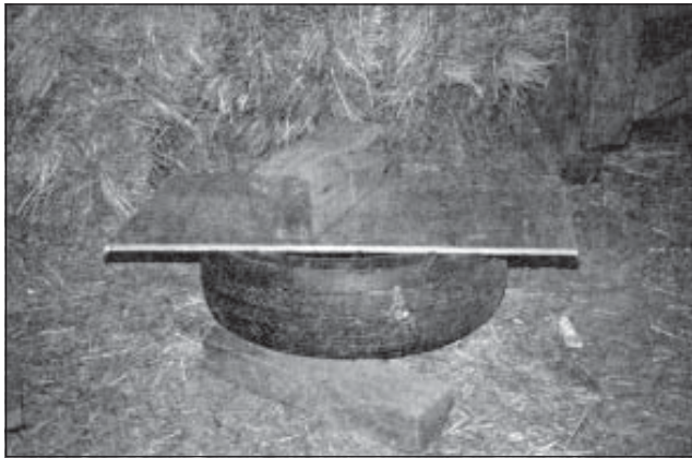
Figure 7. Water bait station

A discarded tire makes an excellent water bait station. It should be elevated on one side to allow rats easy access to bait. Always keep water bait stations covered and filled with Warfarin water bait.