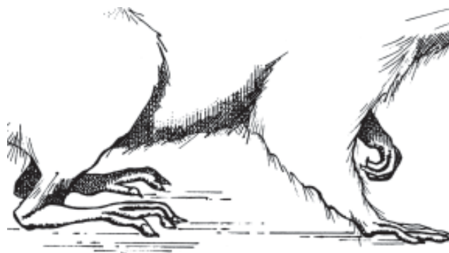
Figure 2. Detail of front and hind feet

Feet – Both front and hind feet of a Norway rat are small, delicate and pink (Figure 2).