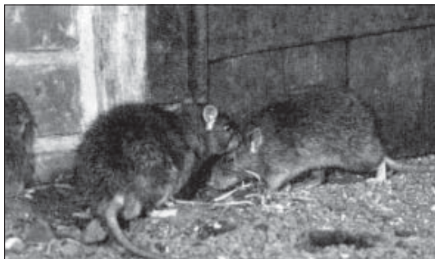
Figure 1. Norway rats

Once secure, rats will quickly seek food. The diet of a Norway rat is remarkable; it can survive on a wide range of food items from domestic garbage, rotten meat and fish, stale grain, greenfeed and straw to fresh fruits and vegetables, packaged foods, sugar and candies.