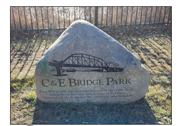
3 INTERPRETIVE BOULDER A - OFF-SITE (REMOVED AND REINSTALLED BY CoRD) L100 N.T.S.