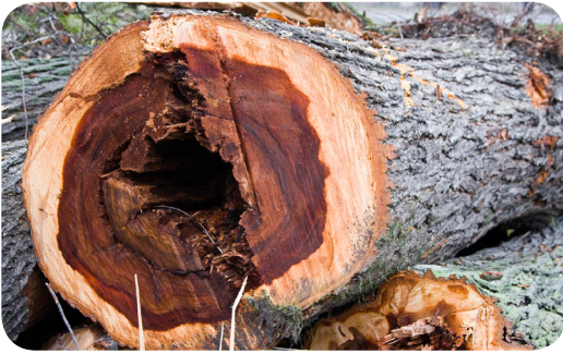
The disease in this elm is easy to see from the inside.

One of the easiest ways to control the spread of invasive species is to simply not move wood from one area to another, even if it's just a few kilometres. You never know what might be hiding in or under the bark.